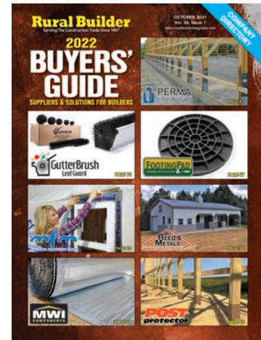
October: Rural Builder Buyers' Guide