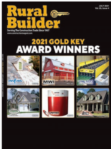
July: Gold Key Awards