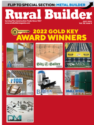
July: Gold Key Awards